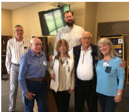
Redmond Interclub visit on 10/18/17