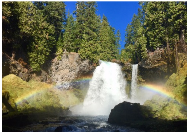
Koosah Falls Last Days of Summer