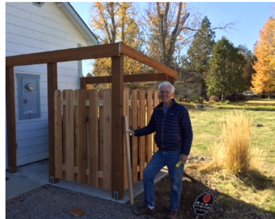
a work in progress building the roof & fencing around the refrigeration equipment at the food bank