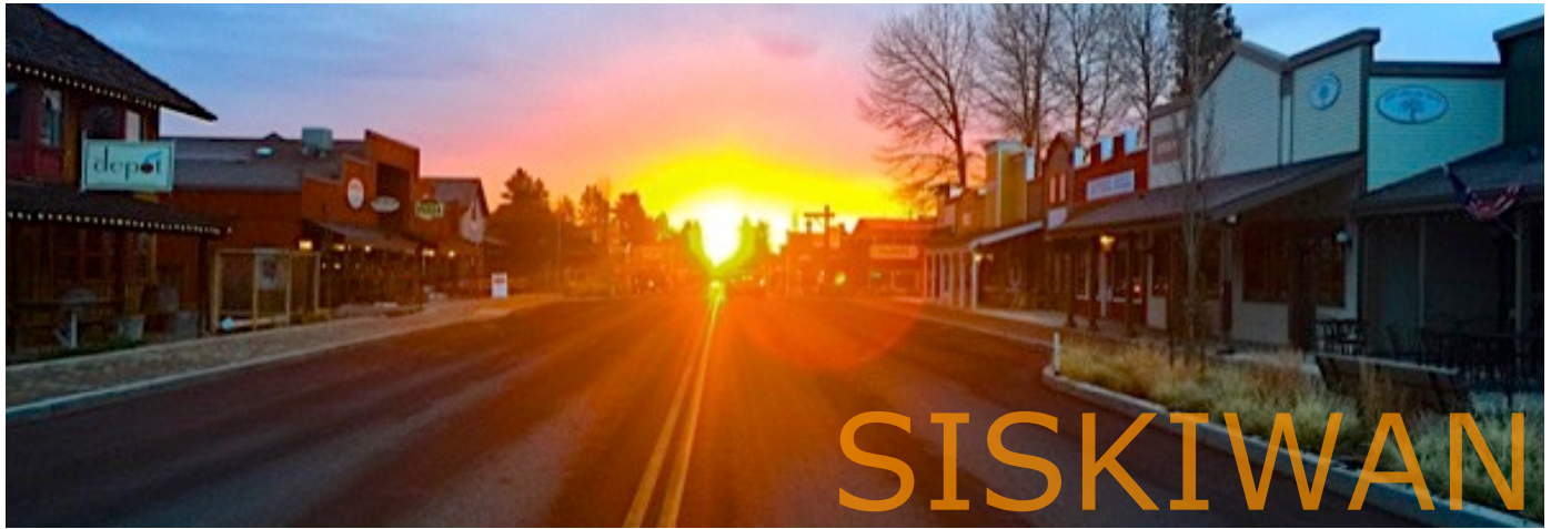
MARCH 2017